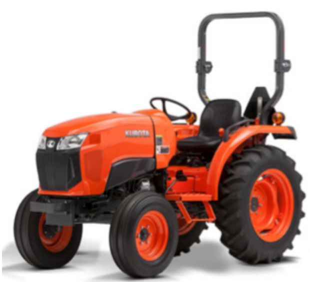
(Not Actual Unit)